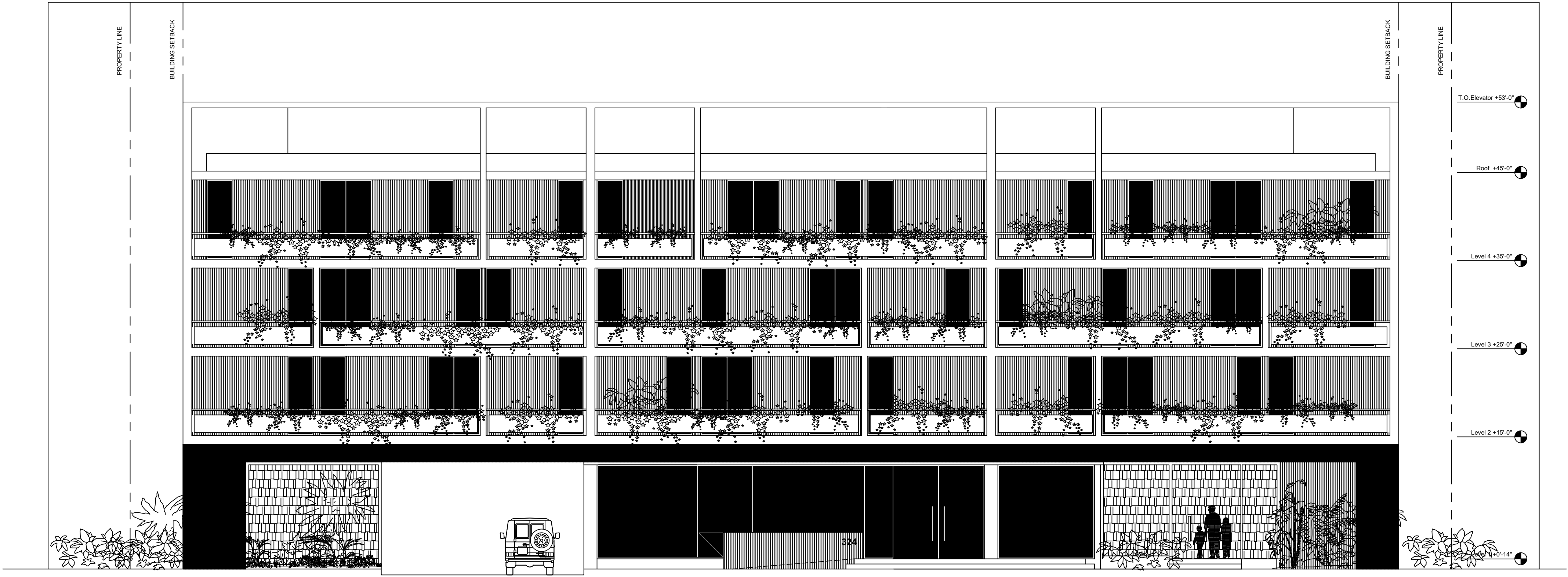
NORTH ELEVATION SCALE: 1/8" = 1'-0"